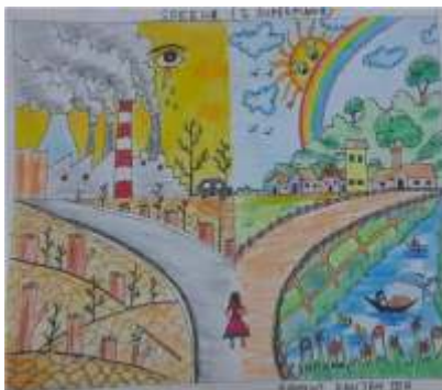
Ramini Ranjan II Prize