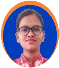
Sonu Painting 100