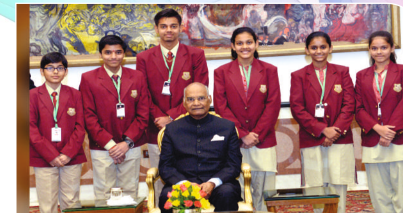
Students blessed by Shri Ram Nath Kovind, The Honourable President of India